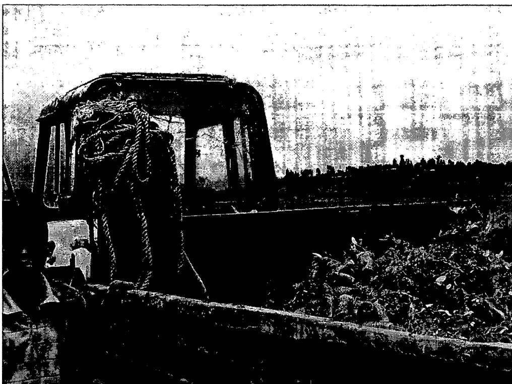
Figure 4: Inappropriate shipment of Eucalyptus globulus seedlings using track from nursery site to planting areas

According to Riley and Steinfeld (2005), the common factors that influence nursery management practices are: seedbed preparation; substrate or soil mixture; seed sources and seed treatments; sowing depth; sowing date; mulching or shading and watering; root pruning; weeding; culling or sorting of seedlings. These nursery stock quality parameters should be used in Ethiopia to produce good quality seedlings of different tree species. But these parameters are not common for nursery managers, not even in the state nurseries. So far, the efforts of international development organizations like the World Agro-forestry Centre and its regional sub-organizations did not yet reach the success which they deserve. Free available publications dealing with nursery management like Jaenicke 1999, and Wightman 2000, for example, did not reach those who are managing the highland and lowland nurseries of central Ethiopia. Moreover, some of the forest tree nurseries of highland and lowland zones of central Ethiopia have no well documented information on nursery management practices suitable for the tree species of regional importance. Finally, quality standards for high quality nursery crop are urgently needed which include the nursery-afforestation site interaction (the target seedling concept: Landis 2002).