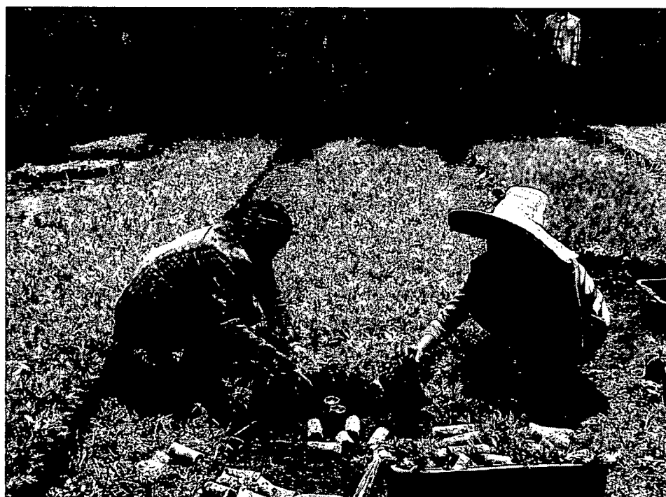
Figure 6: Sorting out the containerized seedlings of Grevillea robusta for shipment in one of the lowland study nurseries.