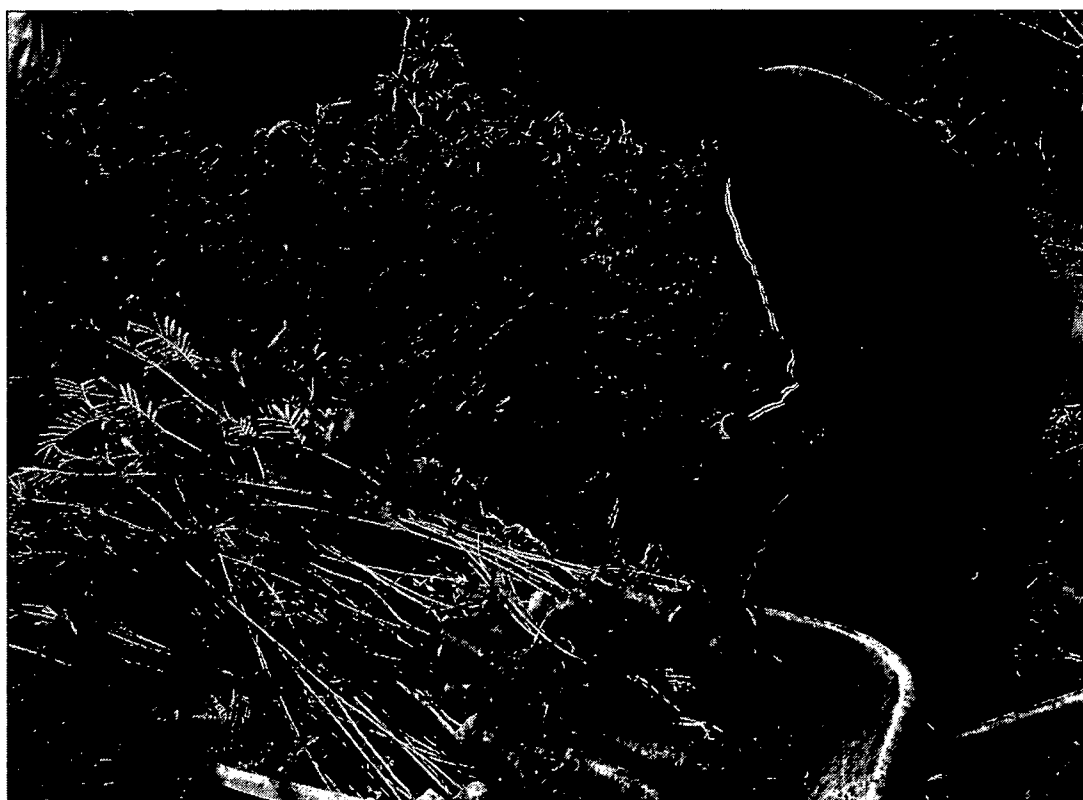
Figure 1: Acacia meurnsii nursery stock, raised in polythene tubes/ bags, is ready for the market (planting). The preparation for shipment is usually done as “hand work”.

Reforestation is one of the most important strategies to reduce the current wood, feed and soil degradation problems in the country. Tree planting practices in Ethiopia encompass or cover all the agro-ecological zones of the country. Official Ethiopian statistics does not give complete information on tree nurseries, but the number has to be assumed with several thousands (according to author's experience). However, there are seedling production constraints such as high mortality rate due to low quality of seedlings. There is also limited information on nursery management practices and inappropriate shipment of tree seedlings from nursery site to planting areas (Figures: 1, 2, 3, and 4).