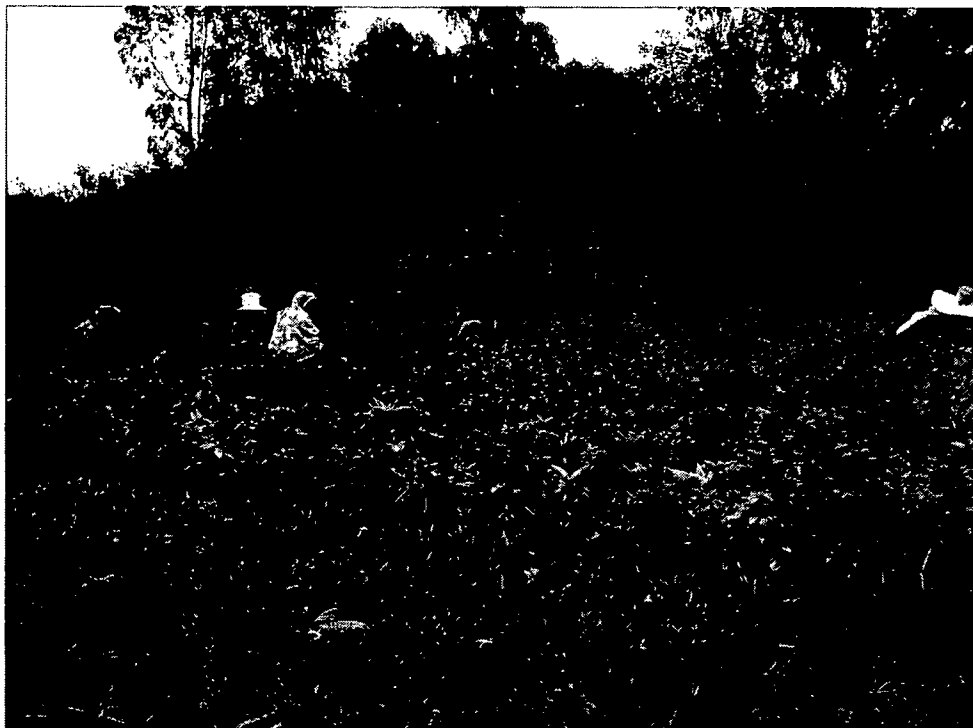
Figure 5 : Nursery workers are in the process of sorting, weeding and root pruning of the containerized seedlings of different tree species in one of the highland study nurseries.