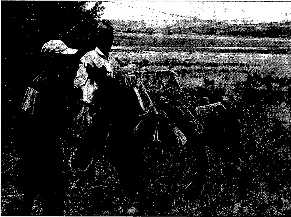
Figure 2: Common shipment of Acacia mearnsii seedlings from nursery site to planting area.