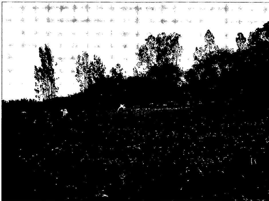
Figure 8: The nursery workers are working in one of the highland study nurseries, consisting of containerized seedlings of different tree species.