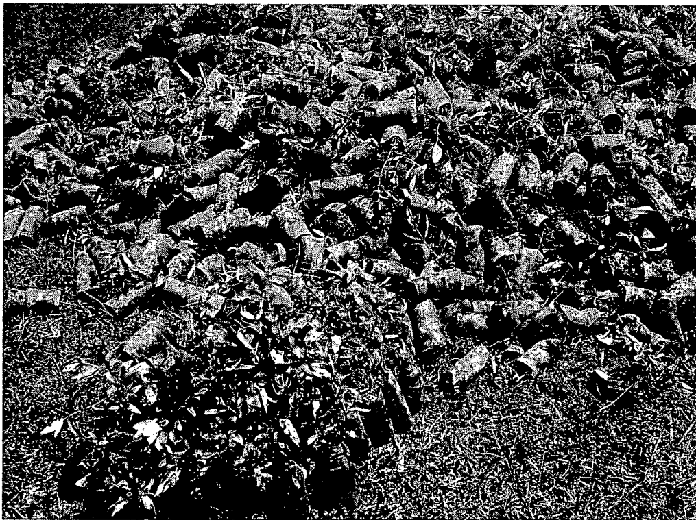
Figure 3: Inappropriate interim storage of Eucalyptus globulus seedlings before out planting.